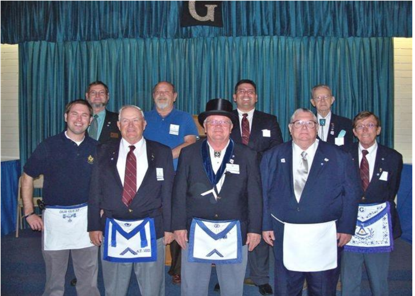
Official Tucson Lodge #4 Visit to Temple Lodge # 51, February 12, 2009