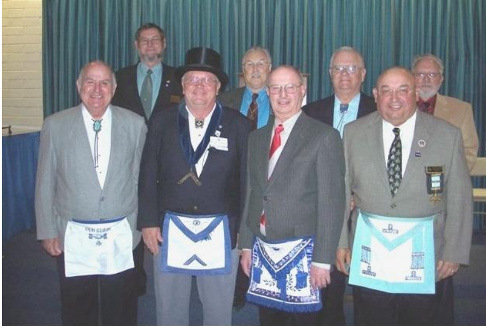
Eloy Lodge #46 Visits Temple Lodge #51 on February 12, 2009